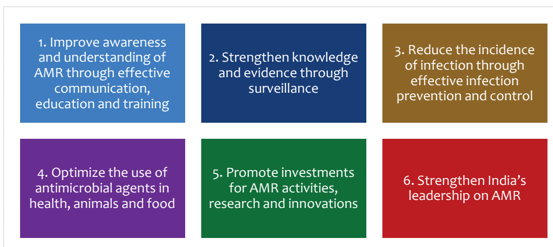
Figure 2: Priorities of NAP-AMR

A harmonized approach across various sectors to address the use of and resistance to antimicrobial agents in human health, animal health, agriculture, food products and the environment is critical to address these strategic priorities.